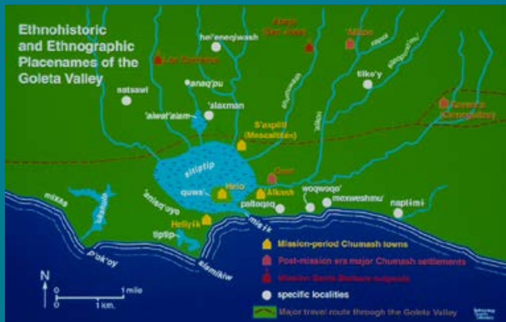
A map of Chumash settlements in Goleta prepared by UC Santa Barbara's Anthropology Graphics Lab.