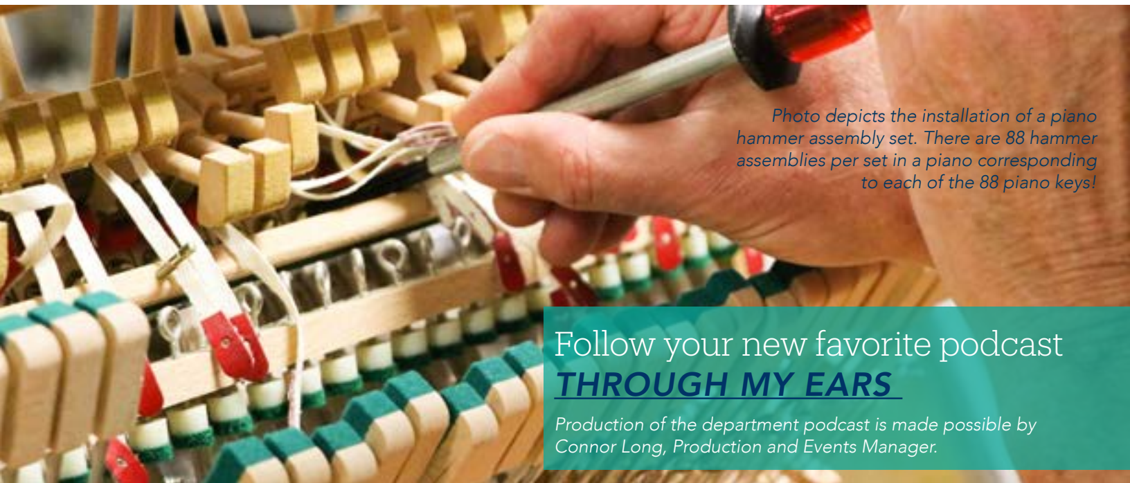
Photo depicts the installation of a piano hammer assembly set. There are 88 hammer assemblies per set in a piano corresponding to each of the 88 piano keys!

Follow your new favorite podcast THROUGH MY EARS