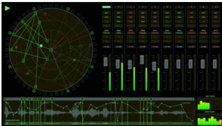
An image of the Space Control interface.

The Department of Music , in association with the Center for Research in Electronic Art Technology (CREATE), has released Space Control , a new software application for sound spatialization. Space Control is a multitrack workstation dedicated to the design, realization, and mixture of spatial gestures for electroacoustic music composition. With its simple interface and minimal learning curve, it makes quick and powerful spatialization available to users of all experience levels.